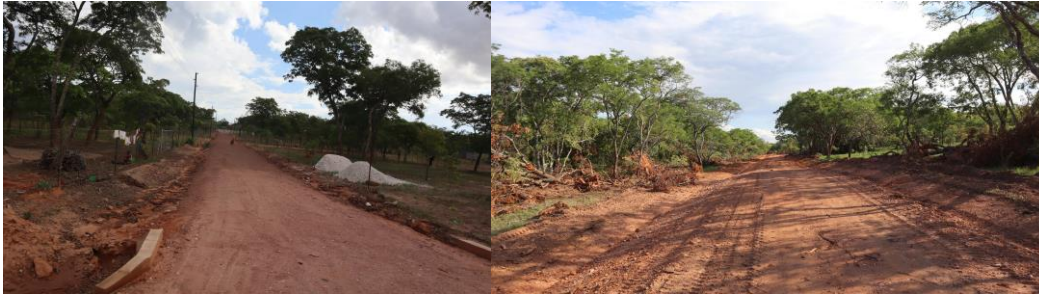
Pictures above: New roads are being graded daily in the forest with trees being cut at a fast rate

As part of the program, a field visit was organized for the participants. The participants took the Twin Palm Road in Ibex just outside Kingslands, through Bauleni compound which is the adjacent community and right into the forest reserve along Leopards Hill Road through to Old Church along the newly graded roads. Below are some of the pictures from the field visit.