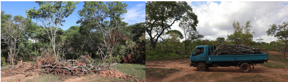
Pictures Above: Trees cut down to create roads which are gathered by the locals for charcoal burning